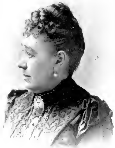
JANE LATHROP STANFORD.

STANFORD, Mrs. Jane Lathrop , philanthropist, born in Albany, N. Y., 25th August, 1825. Her early life was passed in her native place until her marriage to Leland Stanford, a young man of great industry, courage and ambition, but without competency, so far as mere material prosperity is concerned. During the earlier years of struggle and varying fortune she proved herself a true, devoted and faithful wife, gladly sharing all the vicissitudes that came to the lot of her husband, whose indefatigable energy was tested in many a well-fought battle with ungracious fortune. When at last that triumph of human genius and endeavor, the overland railroad, brought marvelous wealth to the heroic men who planned and builded "far better than they knew," Mrs. Stanford found herself in a position to dispense vast means in whatever way she desired. She gave with liberal hand to